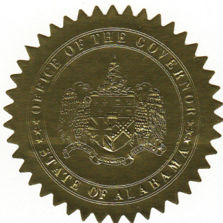
Robert Bentley, Governor